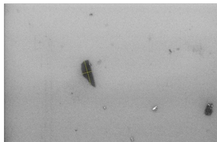
Example SEM image focused on an individual flake. The yellow lines drawn on the flake indicate the lateral size measurements.